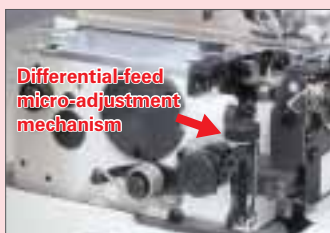
Differential-feed micro-adjustment mechanism

The machine incorporates various mechanisms as standard, such as a differential-feed micro-adjustment mechanism and an external adjustment mechanism for adjusting the feed dog inclination as well as increasing the differential feed ratio, which can be easily adjusted to finish seams that perfectly match the material to be used. Comfortable operation is all but guaranteed, by a wider area around the needle entry, the adoption as standard of a micro-lifter feature that offers improved responsiveness to materials and provides the operator with upgraded operability, and by the reduction of operating noise and vibration, which has been achieved by designing an optimally balanced machine.