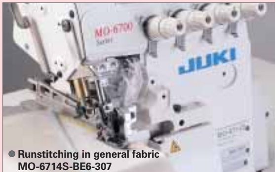
● Runstitching in general fabric MO-6714S-BE6-307

Since the machine comes with a needle-thread take-up mechanism as well as a looper thread take-up mechanism, to offer upgraded responsiveness from light- to heavy-weight materials with a lower applied tension, it achieves well-tensed soft-feeling seams that flexibly correspond to the elasticity of the material at the maximum sewing speed of 7,000sti/min.