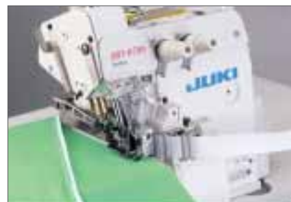
● For rolling-in tape MO-6745S-ED4-360/N077 (N077: Clean finish top and bottom)