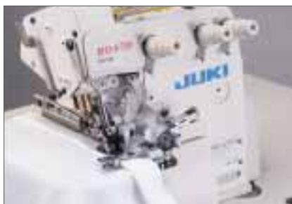
● Blind hemming MO-6705S-0E4-41H/L121 (L121: Blind stitch hemming attachment)

Diversified subclass machines are available. The selection of a machine that best matches the processes in concern are permitted.