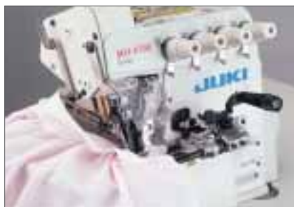
● For gathering MO-6714S-BE6-327/S162 (S162: Swing-type gathering device)